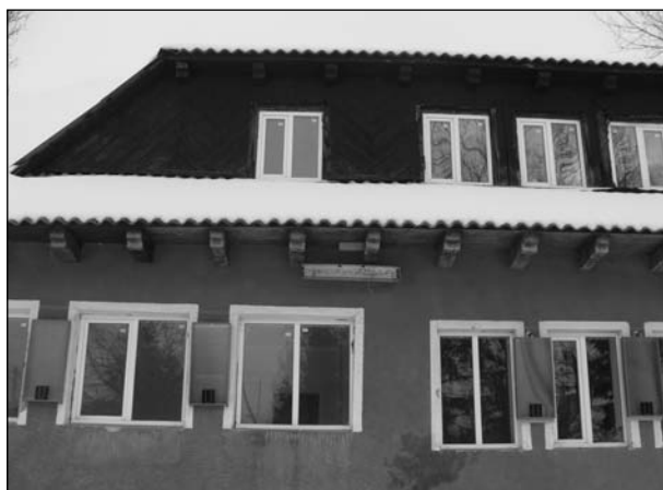
Fig. 5. Installation of solar thermal air collectors on the building of the Catechetical School (town of Deliatyn, Nadvornianskyi Raion, Ivano-Frankivsk Oblast)

Laboratory for Renewable Energy of the Lviv National Agrarian University (Dubliany, Zhovkva Raion, Lviv Oblast (see Fig. 4). They are used for carrying out the long-lasting in vivo tests, making further improvement of collector's design and for training the specialists in the sphere of energy and electrical systems of agricultural complex and promotion of the use of renewable energy. These collectors have also been installed in the catechetical school (town of Deliatyn, Nadvorna Raion, Ivano-Frankivsk Oblast (see Fig. 5),