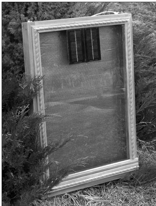
Fig. 2. General view of solar thermal air collector

thod of preparation, and application of sample no. 6 can be considered promising for further development. This sample can be used for manufacturing the solar collector's receiving panel which converts solar energy into heat.