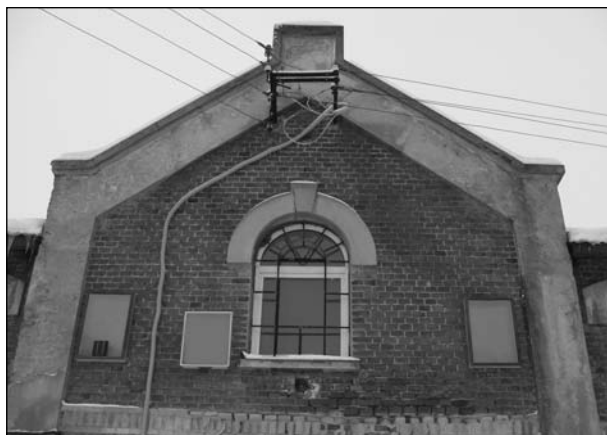
Fig. 4. Installation of solar thermal air collectors on building of the laboratory for renewable energy, Lviv National Agrarian University

The solar thermal air collectors have a wide scope of application in various industries. They can be used for villas, holiday homes, garages, warehouses, museums, wooden churches, greenhouses, etc. As a result of the project the solar thermal air collectors have been installed at the