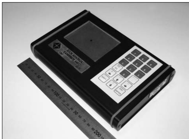
Fig. 2. Exterior of the stand-alone analysis unit