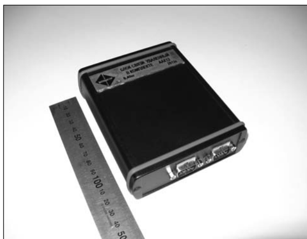
Fig. 4. Exterior of the remote communication unit