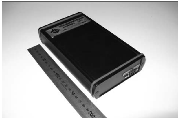
Fig. 3. Exterior of the stand-alone measuring unit